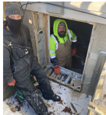
We work year round!!