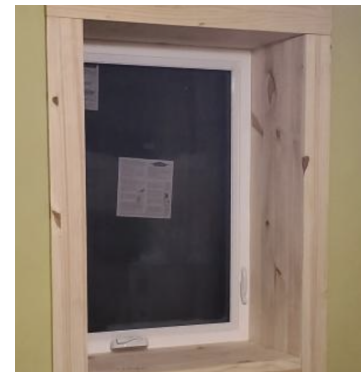
Optional framing pine or cedar